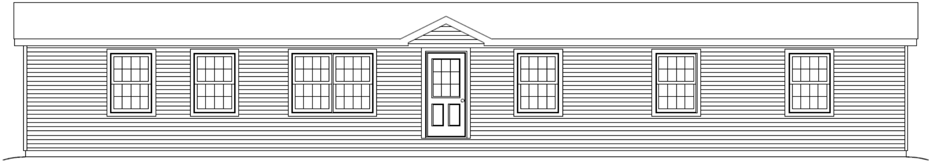
Front Elevation 12908D